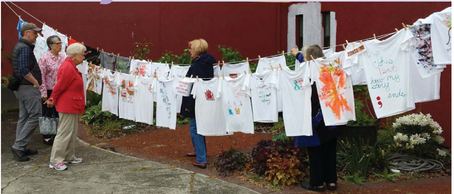
'Clothesline Project,' displayed at the SafePlace Community Service Center during 2016 Spring ArtsWalk.